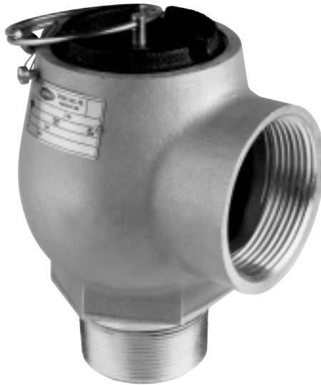
FIGURE 15LC SAFETY VALVE